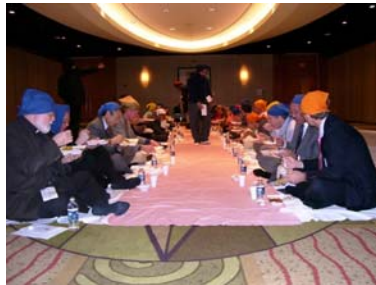
Photo 2 Caption: Langar being served by Sikh volunteers of Sikh Religious Society of Chicago